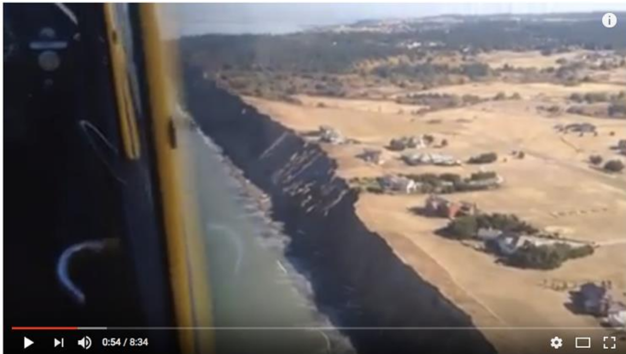
Flying Over Sequim, WA