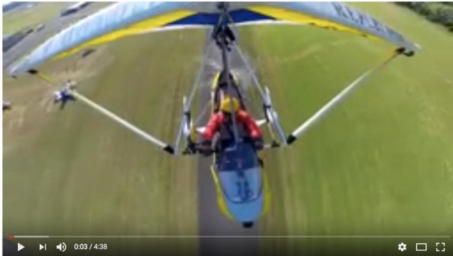
Beautiful Shore Flight - Olympic Peninsula, Washington