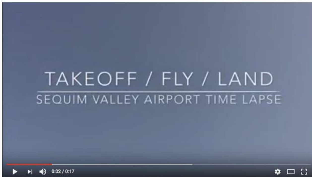
17 Seconds Over Sequim Movie

Time lapse views of takeoff, flying and landing at Sequim Valley Airport.