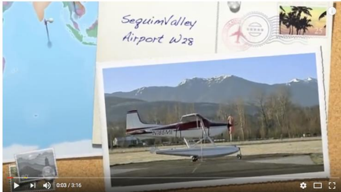
Sequim Valley Airport W28

This slideshow video is about Sequim Valley Airport, It includes airport facilities, local flying, planes and people.