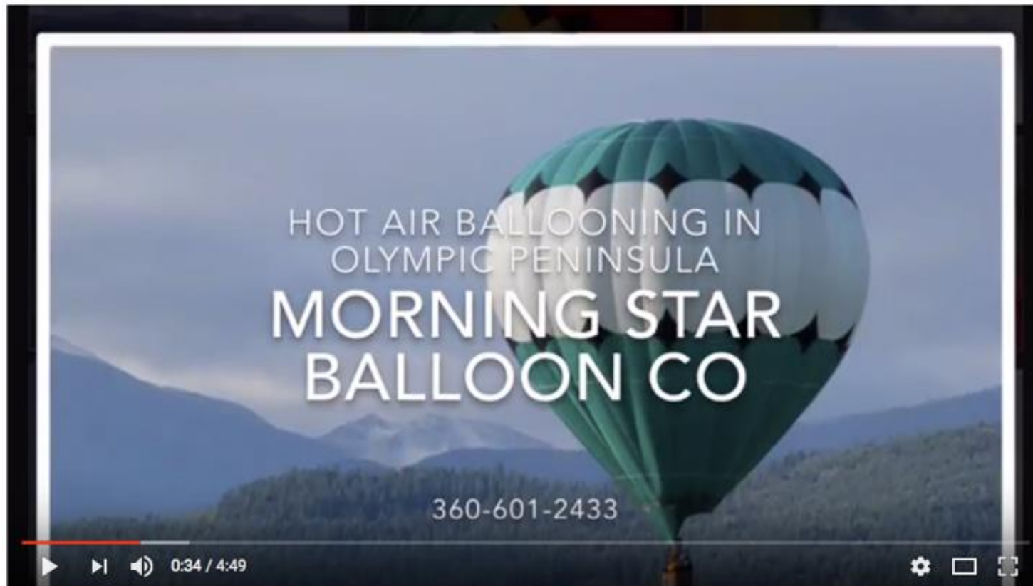
Hot Air Balloon Rides in Olympic Peninsula