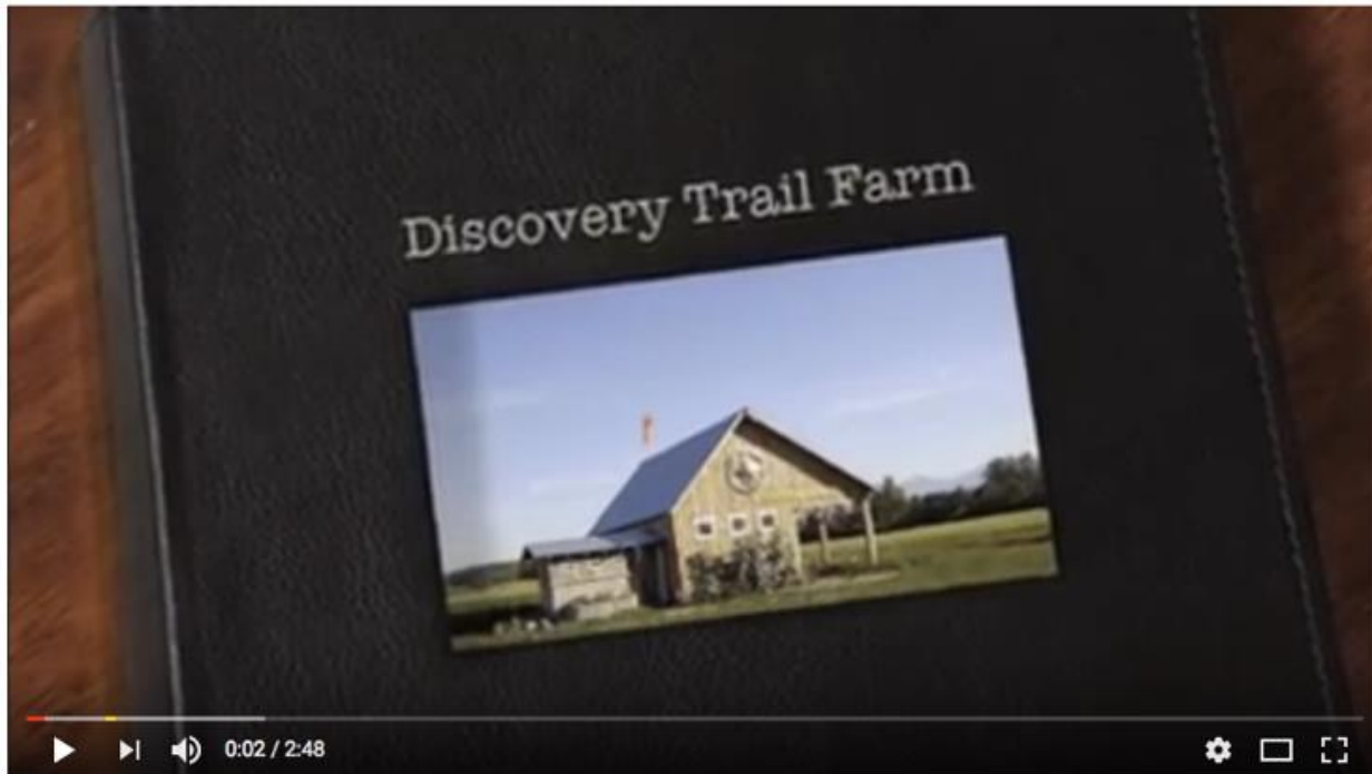
Discovery Trail Farm

This slideshow video is a introduction to Discovery Trail Farm Airpark, This is a residential family airpark in Washington State that is located in the Rain Shadow on the North Olympic Peninsula. the video includes numerous photos, home site information, local flying and Sequim Valley Airport.