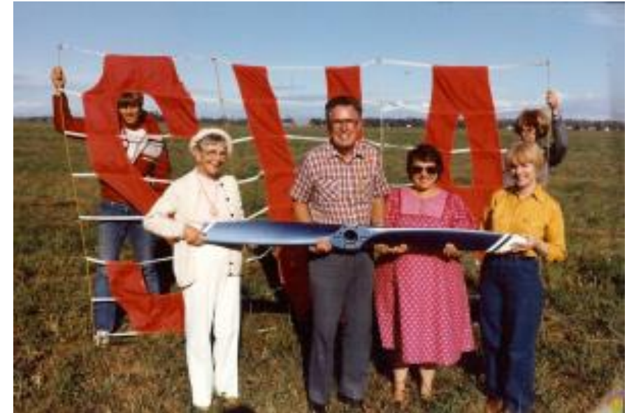
Airport ground breaking ceremony

Through the effort, dreams, contributions and volunteer work of many local people the airport came into existence and by 1985 had a paved / lighted 3500 ft. runway.