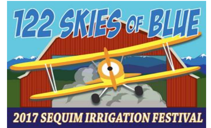
Town Festival in May