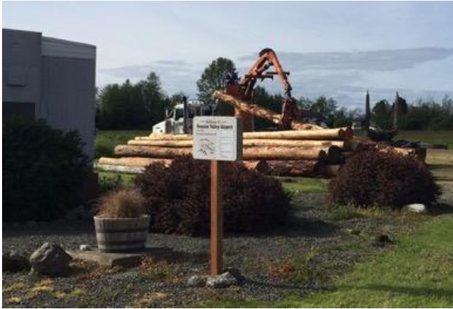
New logs for landscaping