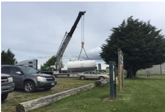
Installing above ground aircraft fuel tank