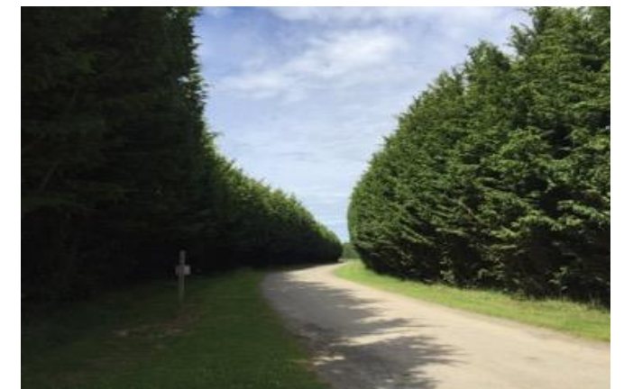
Tree trimming and pavement upgrades